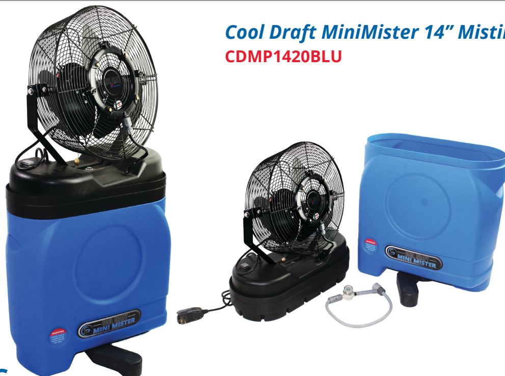
Cool Draft MiniMister 14" Misting Fan CDMP1420BLU

IMPORTANT INFORMATION INSIDE: Read, understand, and follow all safety information and instructions.