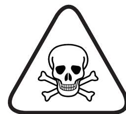
SERIOUS INJURY OR DEATH MAY OCCUR