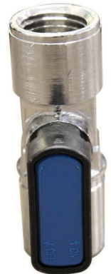
Valve in the “ON” Position WATER FLOW OPEN