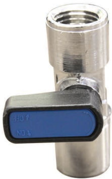
Valve in the “OFF” Position NO WATER FLOW CLOSED