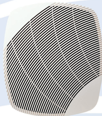
SH Series High Efficiency Quiet Fan

SH Series Fans & Fan-Lights have a high efficiency PSC motor and use half the energy of a standard fan.