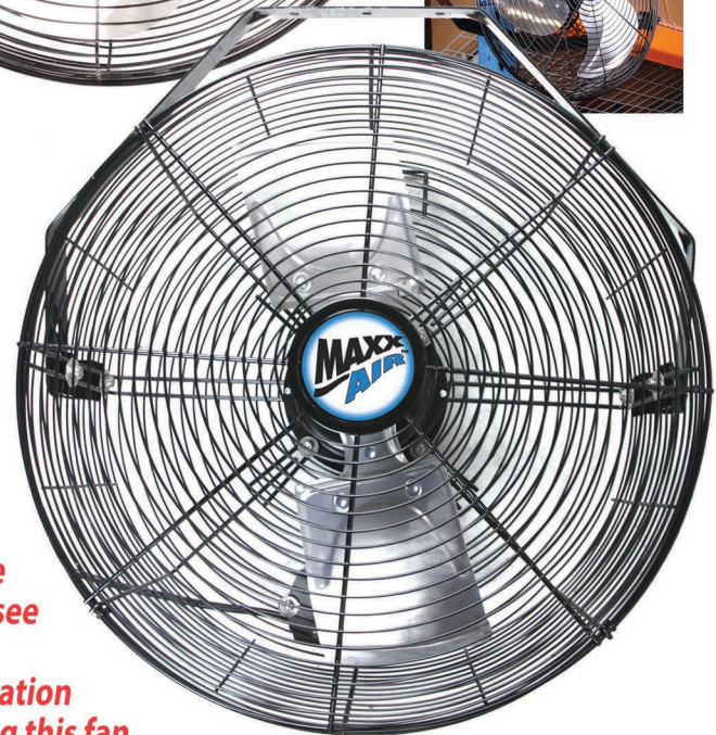
Model HVWM 18CD